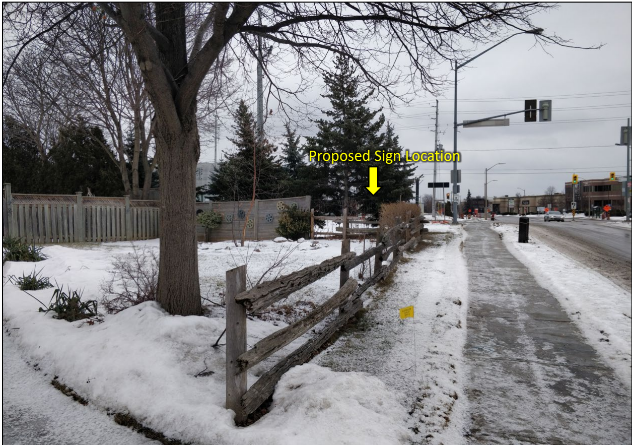
Figure 5 – Looking South towards the Proposed Sign from Barrhill Road (Winter months)

The Proposed Sign will comply with nearly all of the Sign By-law requirements for a digital billboard, including: