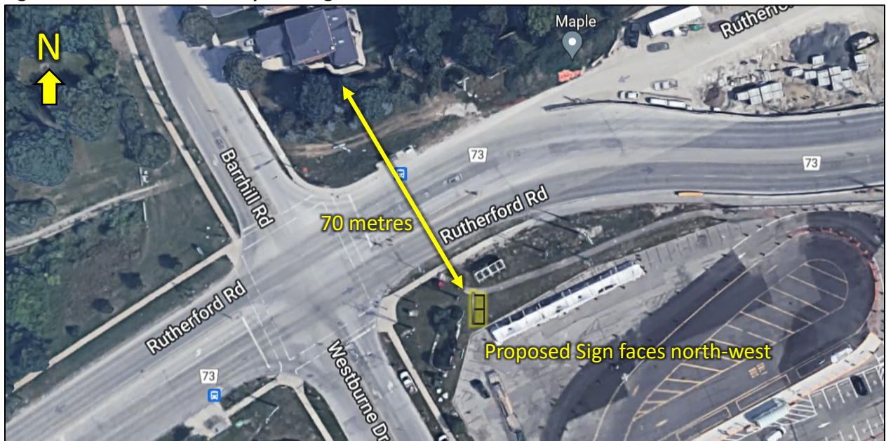
Figure 3 – Location of the Proposed Sign relative to the nearest Residential Use on Barrhill Road

Pattison is seeking a variance for the Proposed Sign to allow for a reduced setback to a nearby residential use – which is 70 metres away where 100 metres is required. However, we believe this variance can be considered minor in nature because the angle of the Proposed Sign and natural barriers in place will ensure it won't be seen by the residential uses to the north.