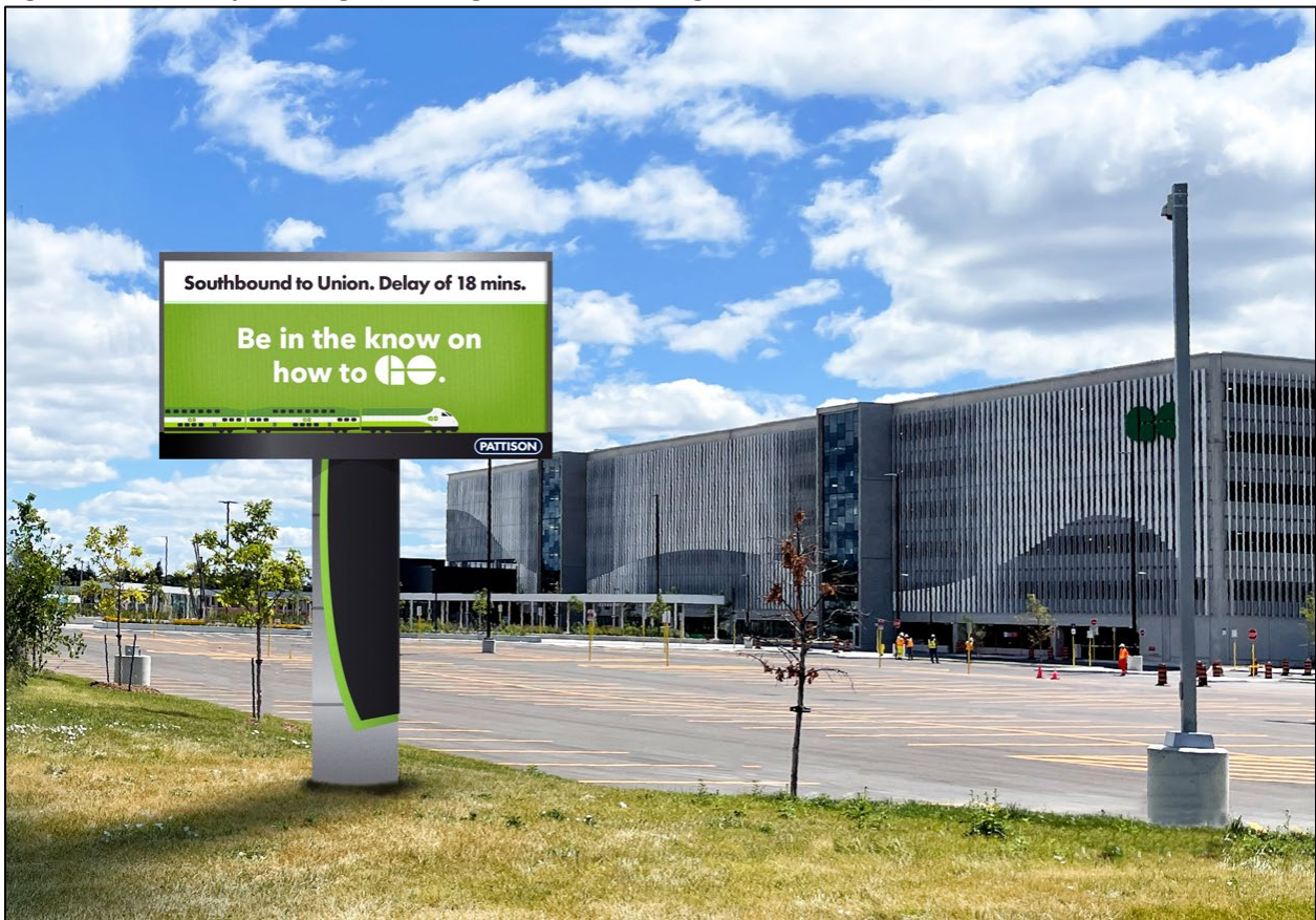
Figure 2 – The Proposed Sign (Looking South-East along Rutherford Road)

The subject property is zoned ' EM1 – Employment ', and currently contains the Rutherford GO Station and an associated above-grade parking lot. Metrolinx is in the midst of a large renovation of the elevated parking structure, as well as the station itself. The Proposed Sign is part of a large network of new digital signs Metrolinx is looking to incorporate into the newly designed stations and parking structures across the Province, to provide updates and news to transit users.