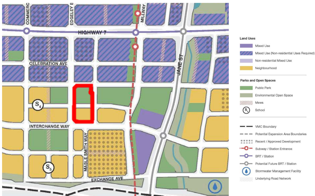
Figure 2: Recommended VMCSPP Land Use Option