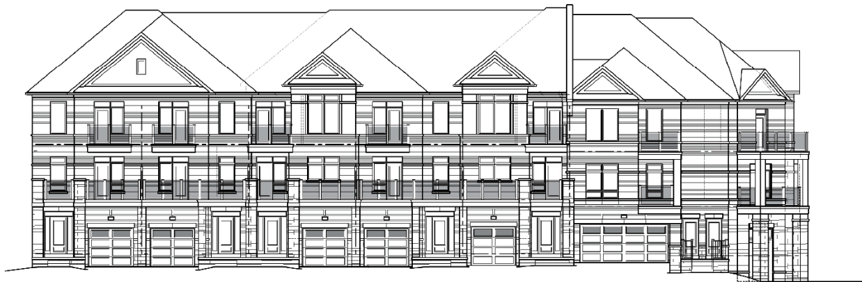
Rear Elevation - Facing East's Corners Boulevard