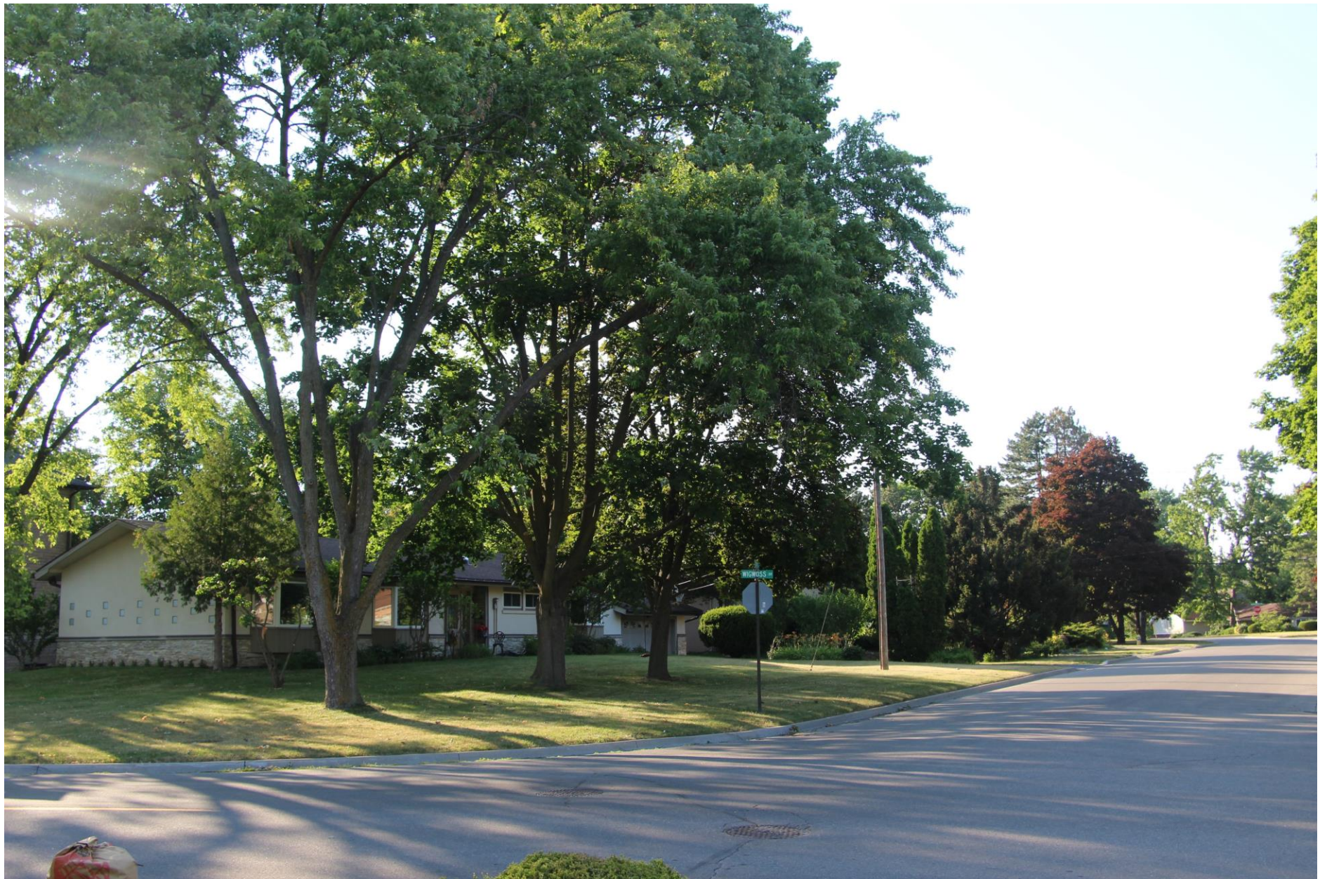
“The House with the Small Square Windows”, 1958 (Tayok & Wigwoss)