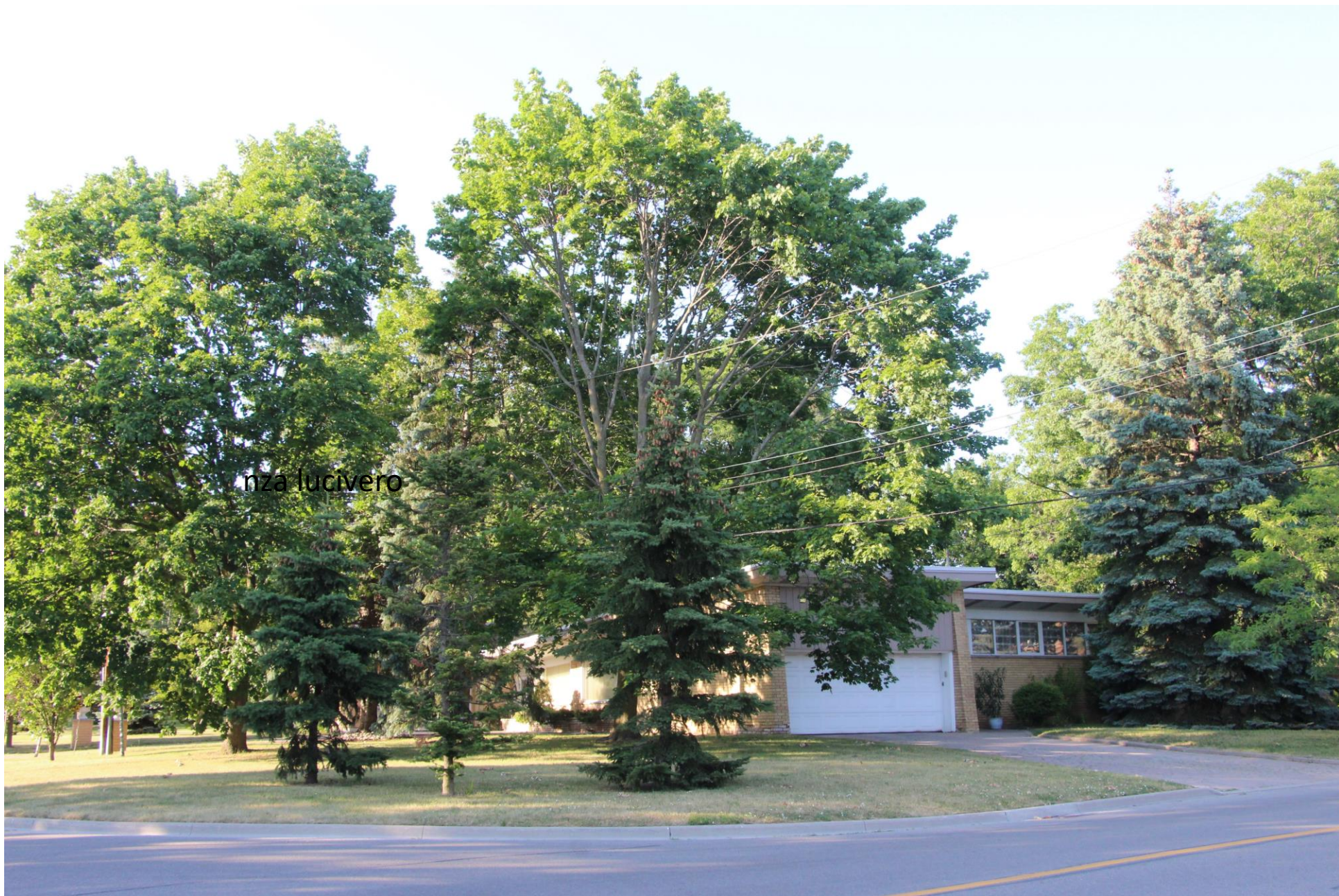
“The unique horseshoe-shaped house with the clerestory windows”, 1957 --- Tayok & Wigwoss