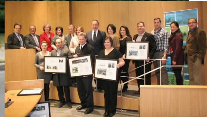
“The Barclay House”, Architect, Stanley Bennett Barclay, 1958 – 2012 Heritage Preservation Award * listed as a property of heritage interest with the City of Vaughan