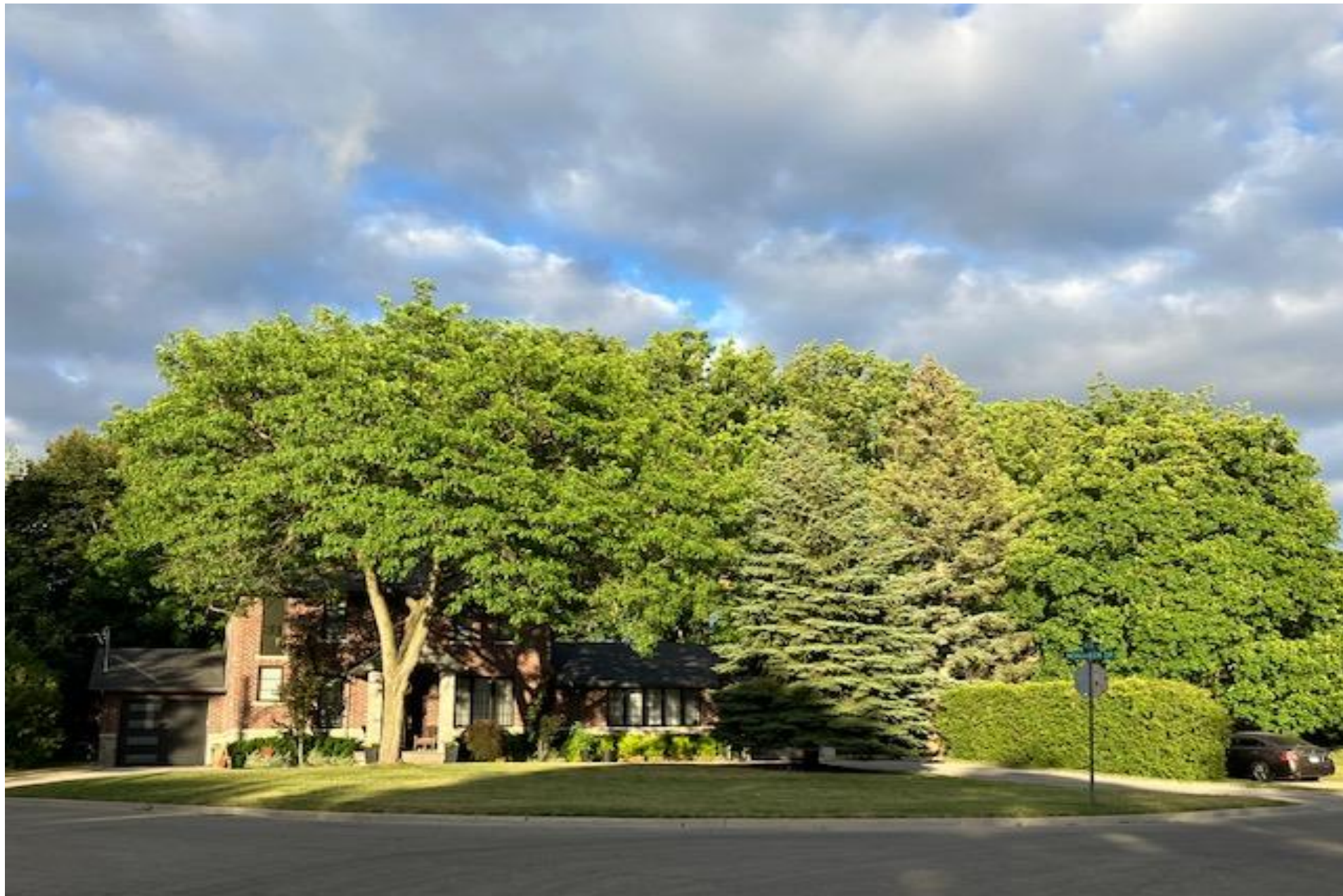
Southeast corner of Tayok & Monsheen