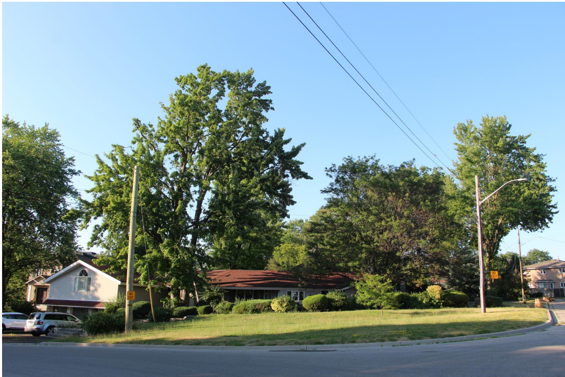
Northeast corner of Tayok & Monsheen