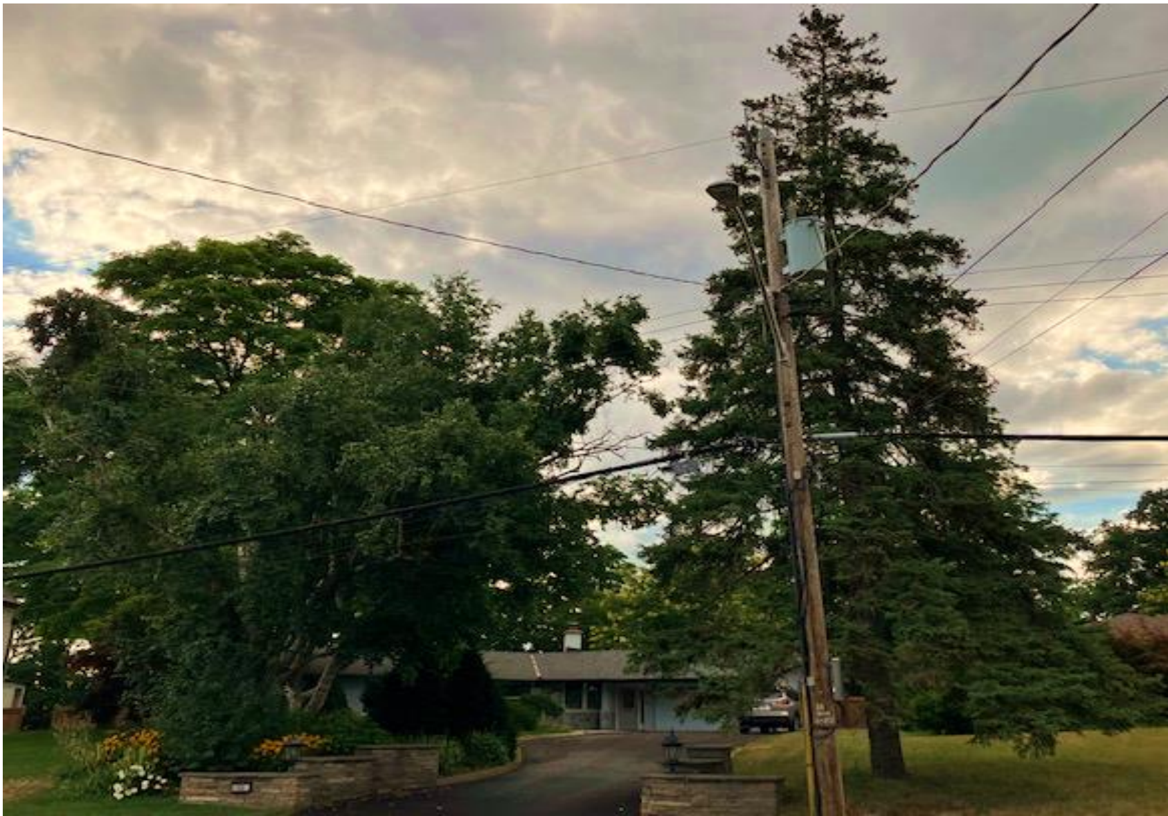
“The Chalet House”, 1950s, concrete steel beam; wooden panelling on ceiling which pitches up to centre, hexagon-shaped ; rotunda with kitchen on the side; hangs over bluffs; front sunken courtyard & walkout basement; hanging staircase with a rock waterfall fishpond underneath