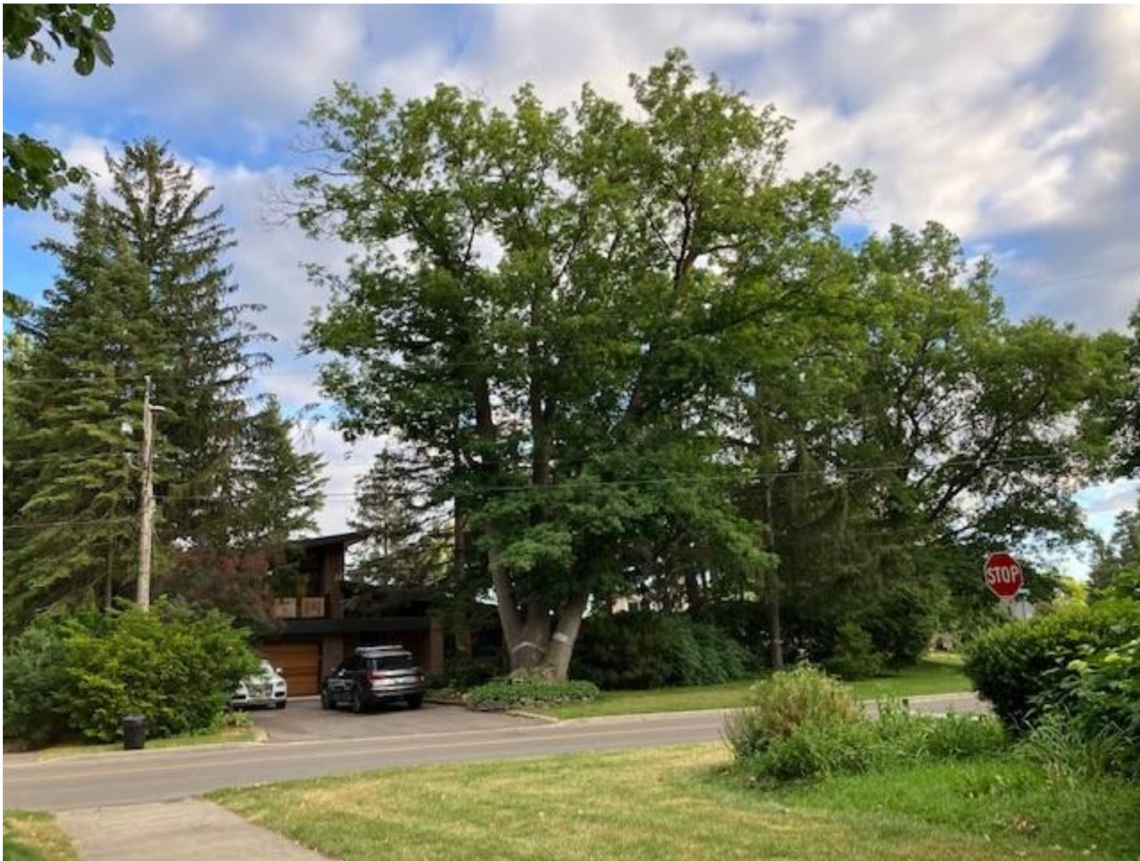
“The House with the ancient oak tree with 4 trunks” – Wigwoss & Monsheen

Midcentury post and beam home with low sloped hemlock ceiling and cedar wood panelling