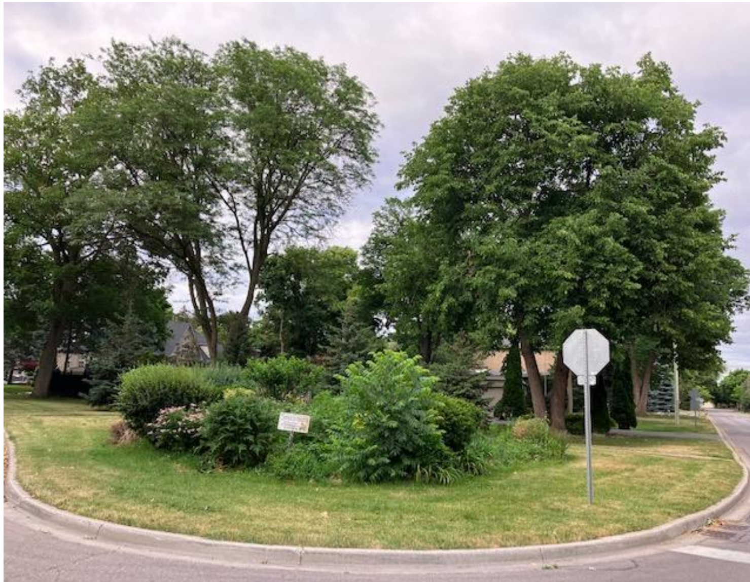
Community Garden – Sandra's Garden & Bench Community Volunteer plaque issued by City