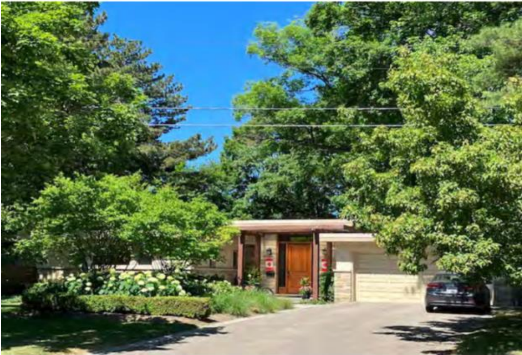
“The 4 level house that looks like a bungalow”, 1959-- Monsheen Drive