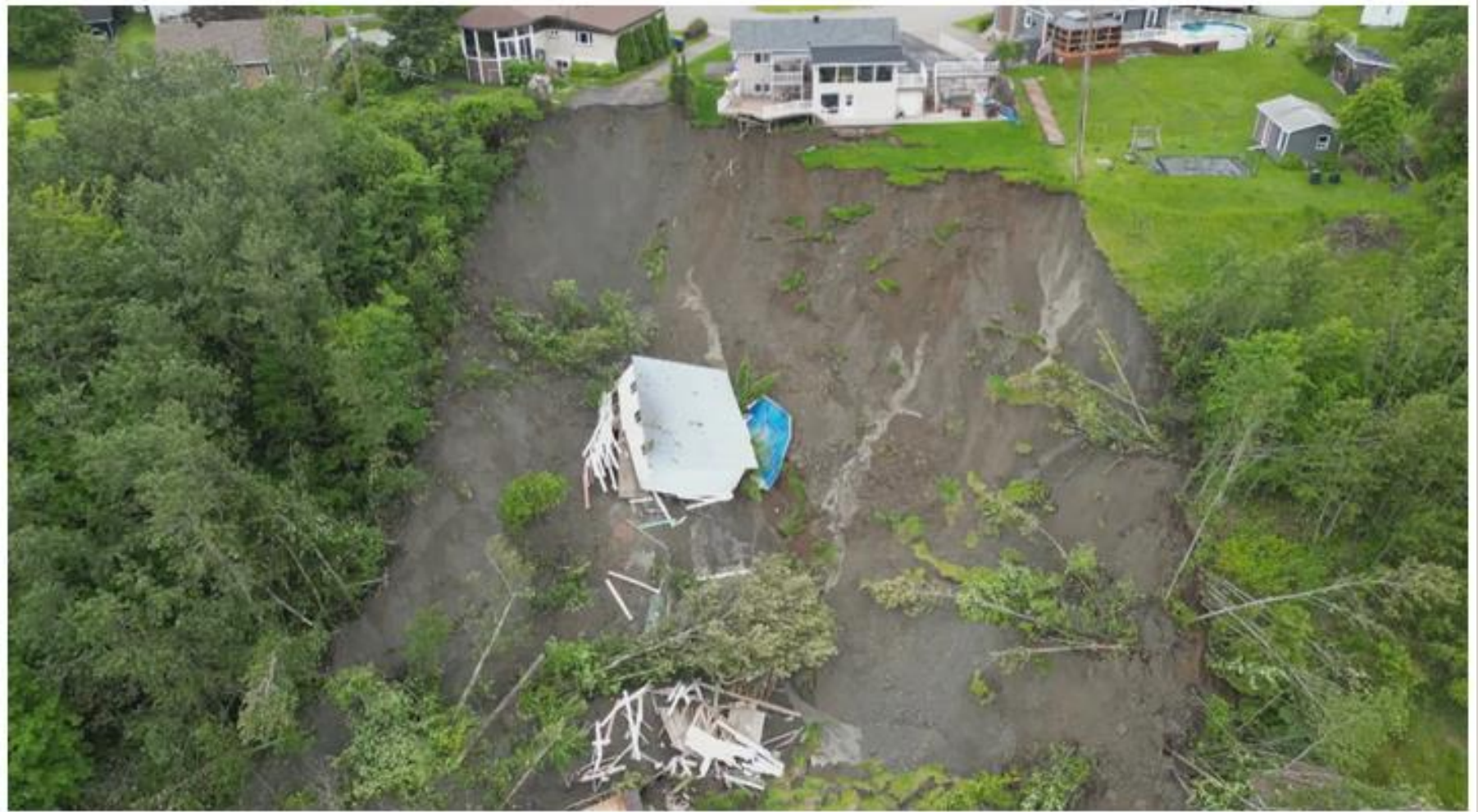
An aerial image shows the extent of the landslide in Saguenay's La Baie neighbourhood.

There are consequences for the area when trees are removed . Many oaks are hundreds of years old in Seneca Heights. This is similar to what happened at 140 Monsheen Drive.