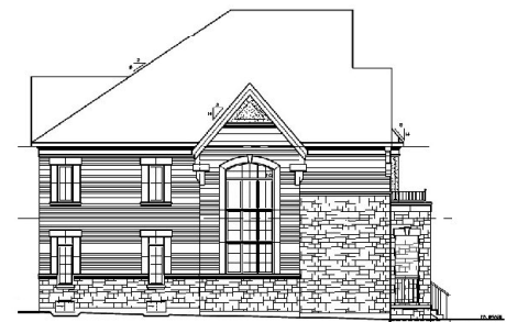
SOUTH ELEVATION (LEFT)