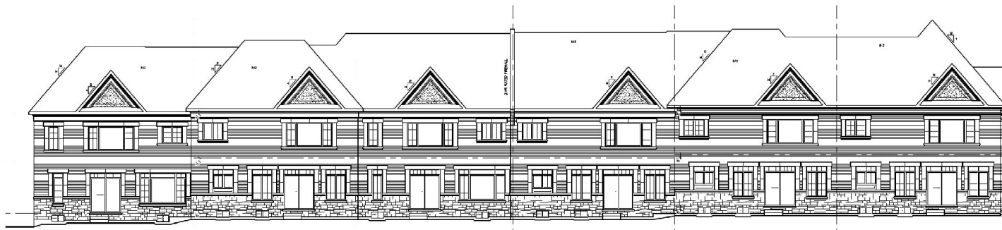
WEST ELEVATION (REAR)