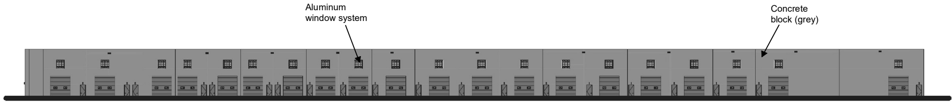
East Elevation - Facing Interior Driveway