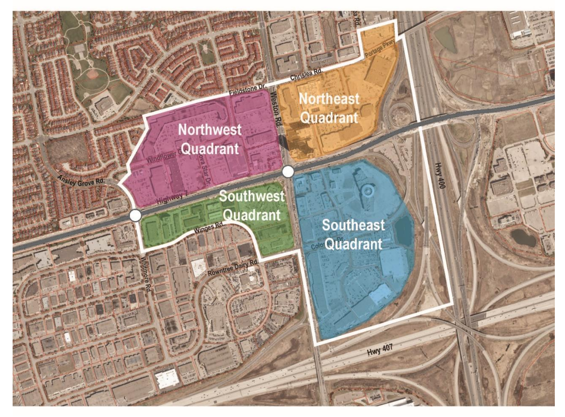
Map 3 – Weston 7 Secondary Plan quadrants