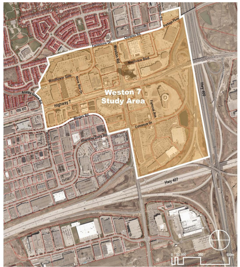
Map 1 – Weston 7 Secondary Plan location map

g) WESTON 7 is comprised of 31 properties that are largely characterized by large footprint commercial buildings and associated large surface parking lots. As it exists today, as identified on Map 2 , the core function of WESTON 7 is a commercial and entertainment destination for the City of Vaughan and the broader region. WESTON 7 also includes a range of smaller scale service commercial uses and restaurants and a number of light industrial uses.