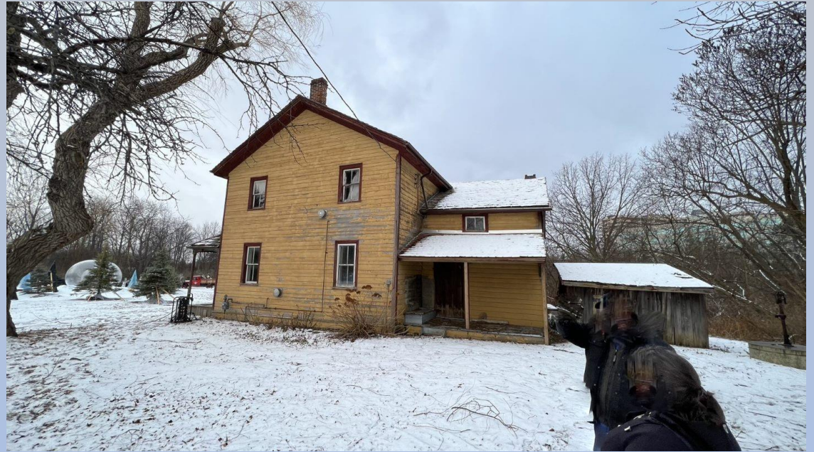
Schmidt-Dalziel Log House, 1808