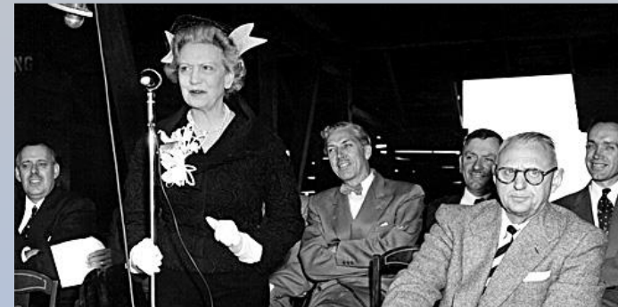
Dalziel Agricultural Museum Grand Opening, Elizabeth Arden Guest of Honour 1956