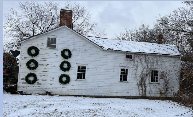
Sawyer's House, Circa 1835 Originally Lot 6, Conc 5, Vaughan