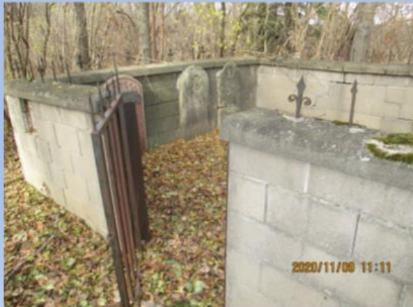
Dalziel Family Cemetery