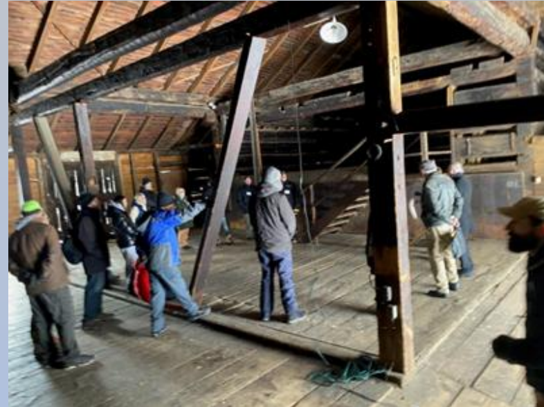
Inside Schmidt-Dalziel Barn, January 28, 2023