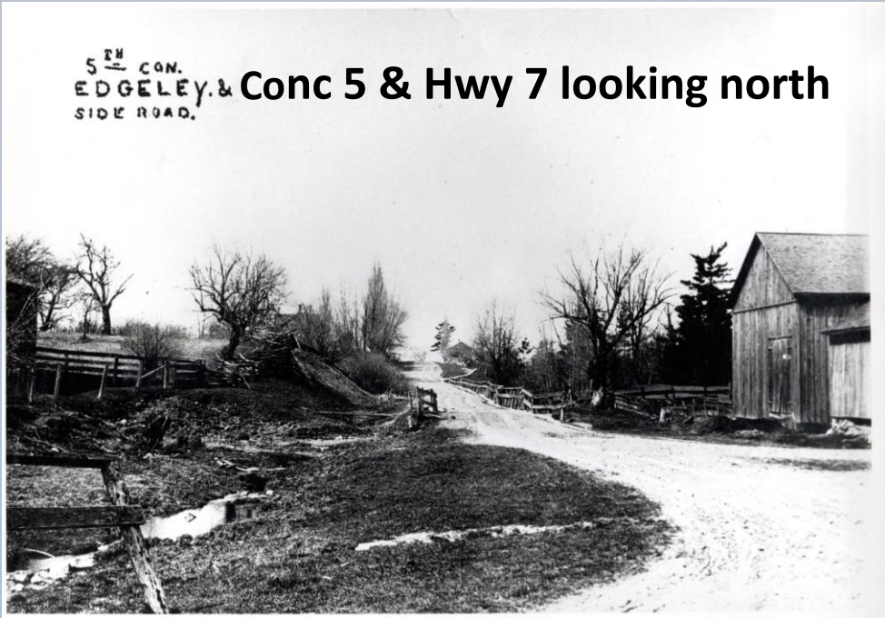
5 TH CON. EDGELEY & Conc 5 & Hwy 7 looking north SIDE ROAD.