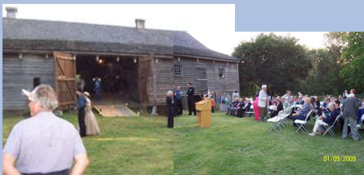
Schmidt-Dalziel Barn Bicentennial Celebration 2009