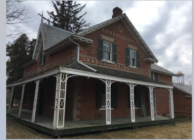
James Dalziel House, built 1870