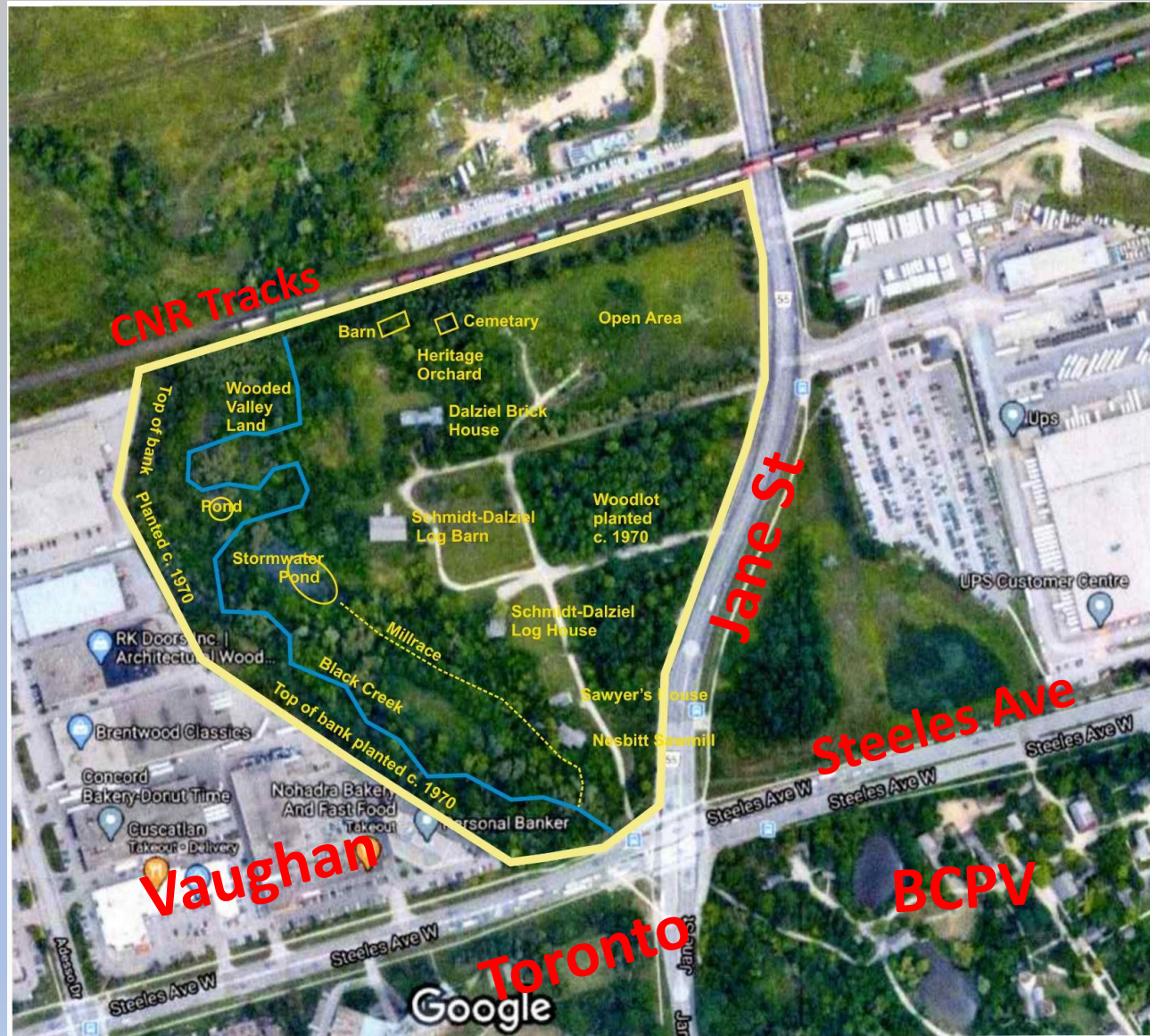
BCPV North Property