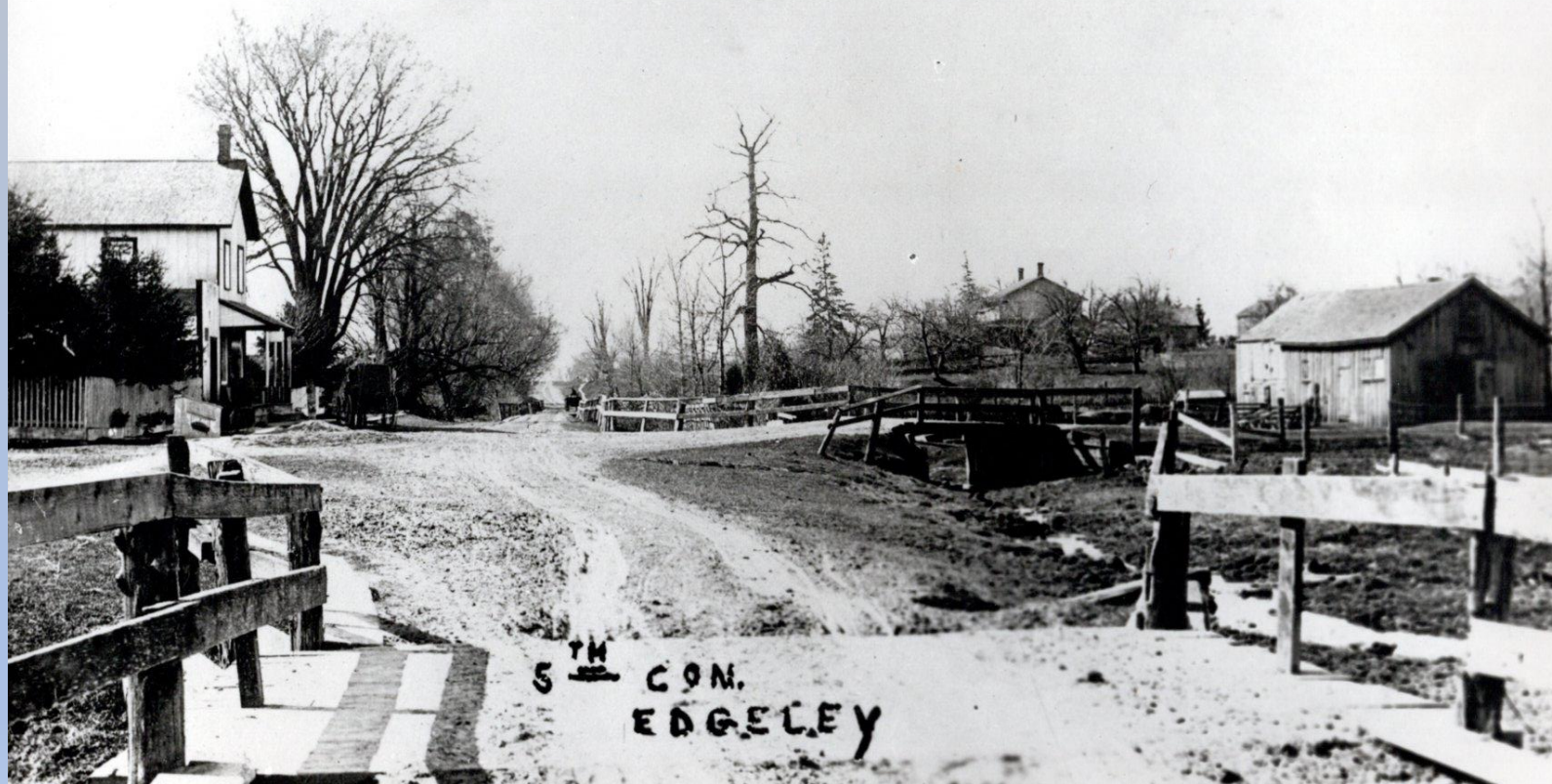
Conc 5 & Hwy 7 looking south from bridge on north side of Hwy 7