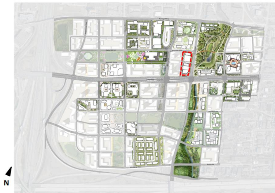
7800 Jane Street Development Site in Context