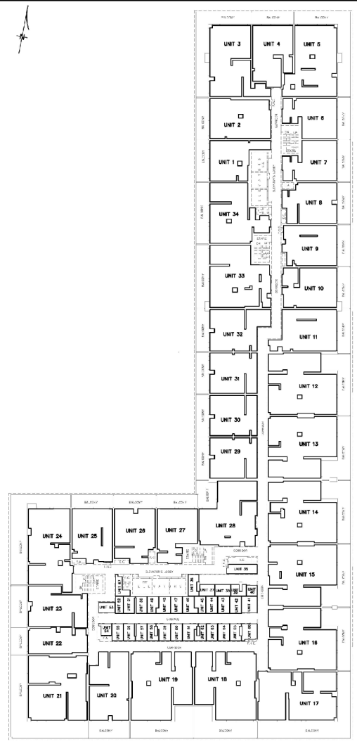
RESIDENTIAL UNITS 1 TO 34, INCLUSIVE PREMIUM STORAGE UNITS 35 TO 67, INCLUSIVE ON LEVELS 3 AND 4