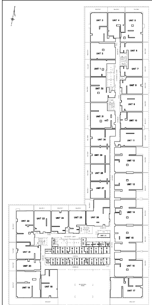
RESIDENTIAL UNITS 1 TO 32, INCLUSIVE PREMIUM STORAGE UNITS 33 TO 65, INCLUSIVE ON LEVEL 5