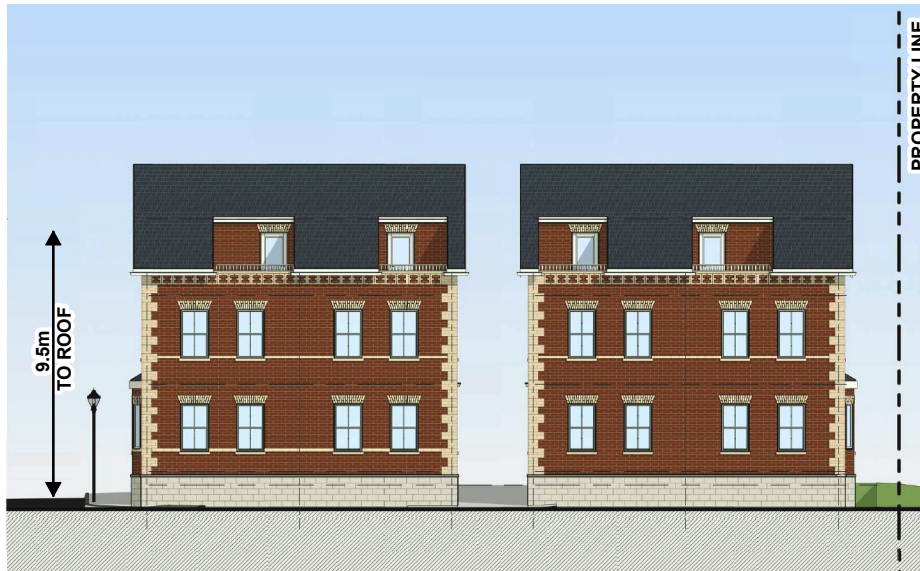
EAST ELEVATION - REAR