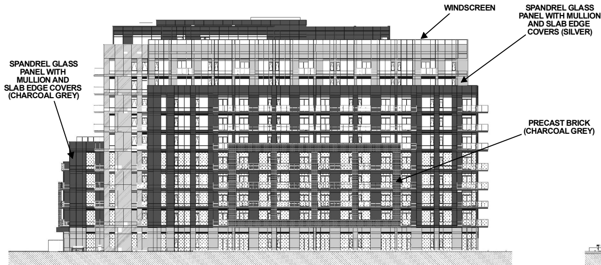
SOUTH ELEVATION - FACING HIGHWAY 7