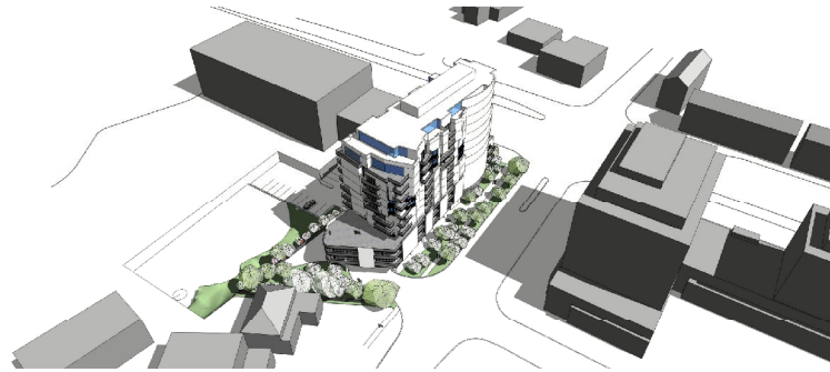
AERIAL VIEW FROM NORTHWEST