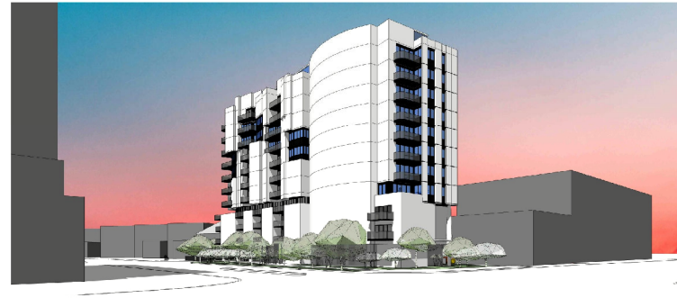
VIEW FROM SOUTHWEST