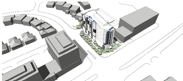
AERIAL VIEW FROM SOUTHWEST