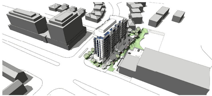
AERIAL VIEW FROM SOUTHEAST