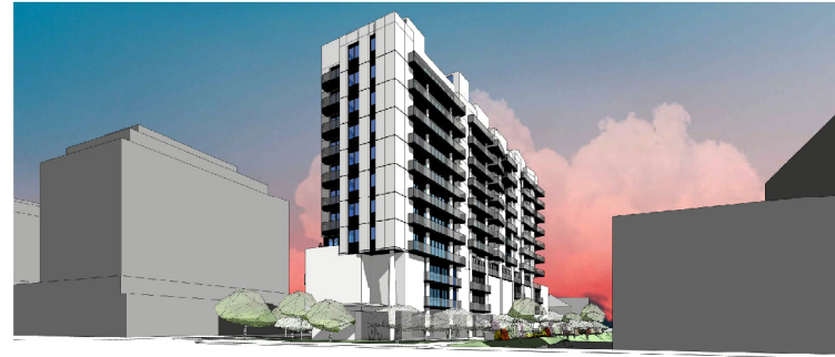
VIEW FROM SOUTHEAST