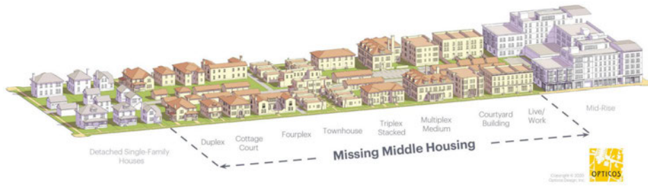
Figure 1 - An Illustration of the Missing Middle