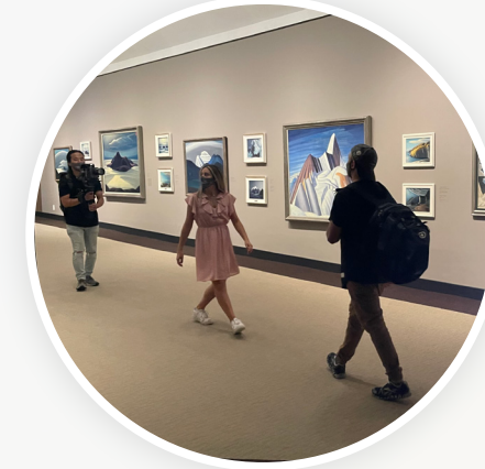
2021 Awards Show Video