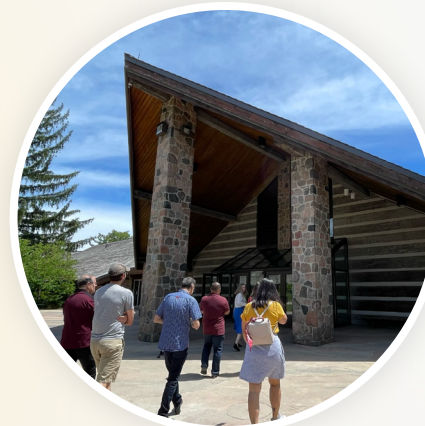
2022 Familiarization Tour