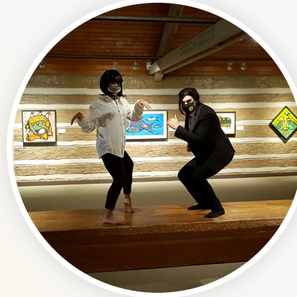
2020 'Pulp Fiction' Video