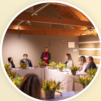
2022 VIP Pre-Launch Dinner