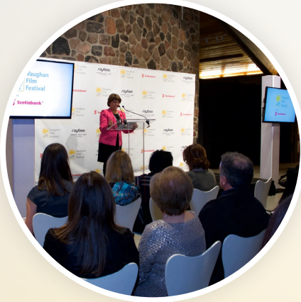
2015 Fall Launch