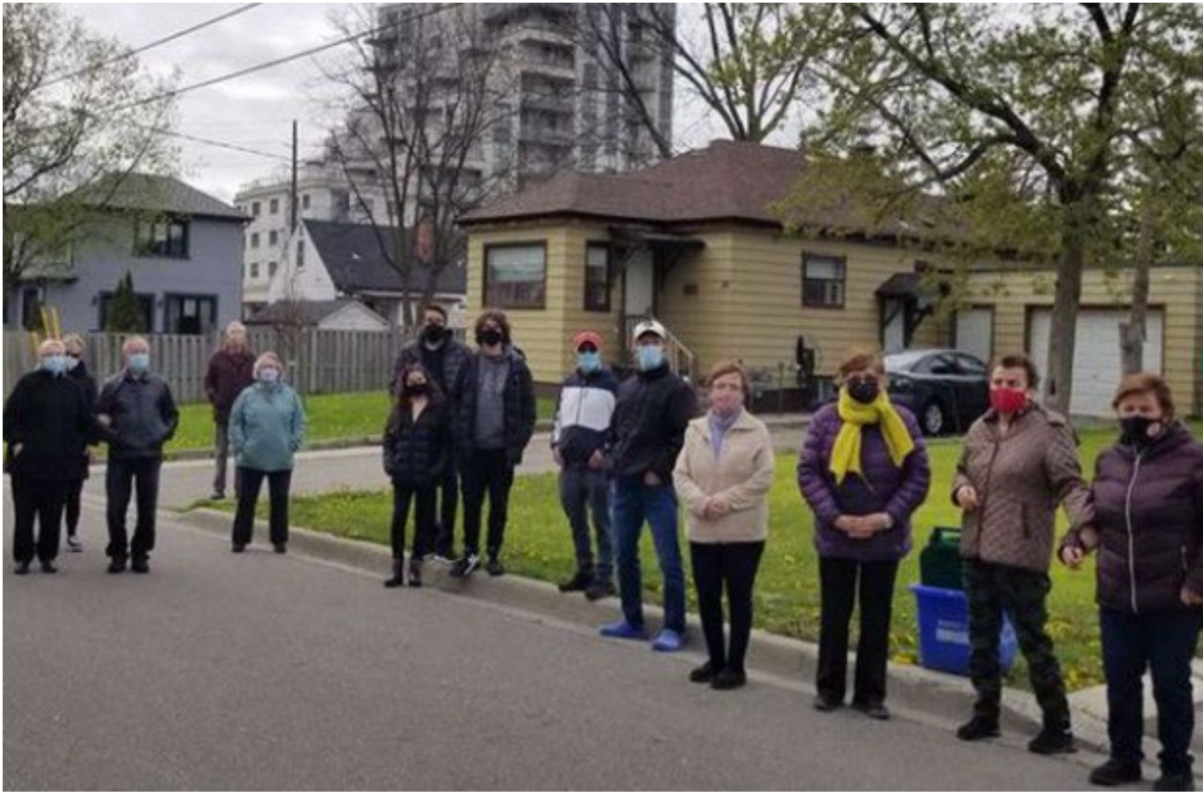
A few concerned members of South Kipling Residents' Associations (seniors, disabled & children)!