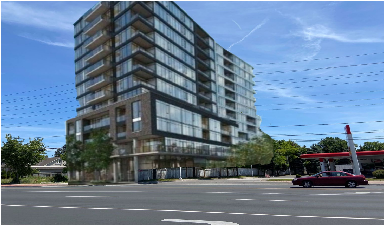
PROPOSED DEVELOPMENT - Ideal Situation No Traffic!