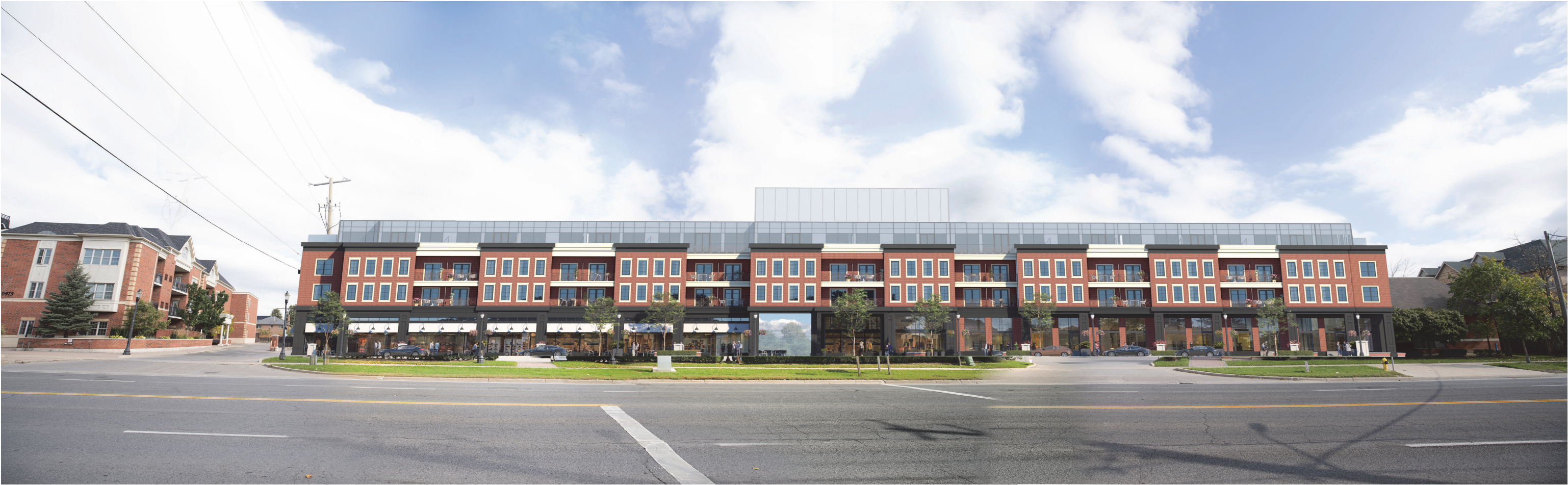
FRONT VIEW ▪ Trinity Point ▪ Keele Street & Major Mackenzie Drive ▪ 1240.14D ▪ Oct. 20, 2021