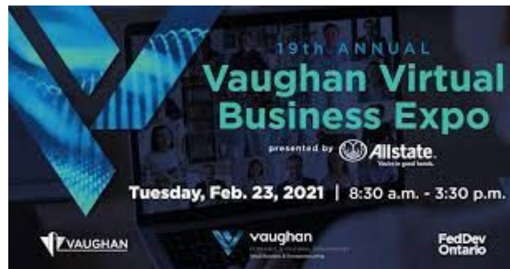
Vaughan Business Expo Mentor and Exhibitor