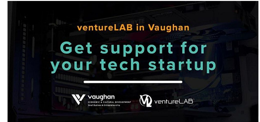
Programming for Vaughan Entrepreneurs