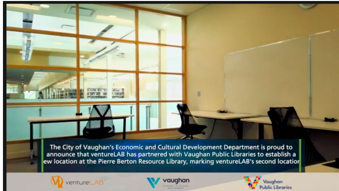
ventureLAB @ Vaughan Innovation Space