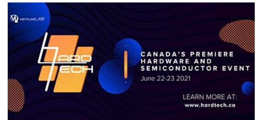
ventureLAB's HardTech Conference