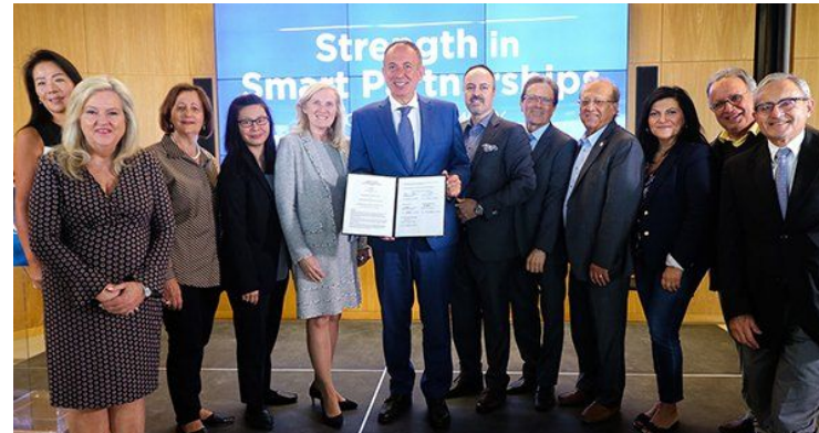
Vaughan Healthcare Centre Precinct