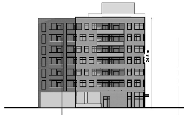
BUILDING 01 - NORTH ELEVATION