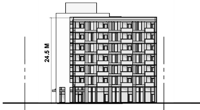
BUILDING 01 - SOUTH ELEVATION