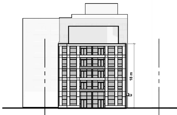
BUILDING 02 - NORTH ELEVATION