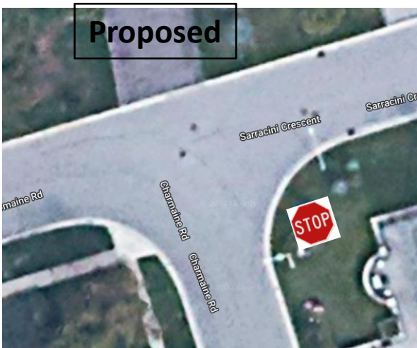
North intersection of Charmaine Road and Sarracini Crescent Relocated Stop Sign Location