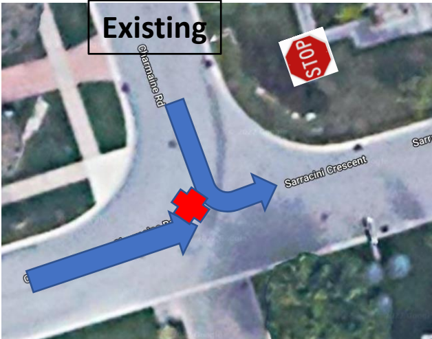
North intersection of Charmaine Road and Sarracini Crescent Existing Stop Sign location and showing potential conflict point