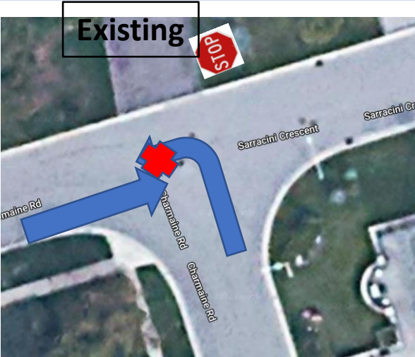
South intersection of Charmaine Road and Sarracini Crescent Existing Stop Sign Location and showing potential conflict point