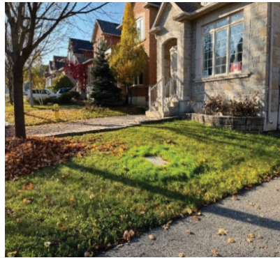
Figure 2: Burgundy Trail