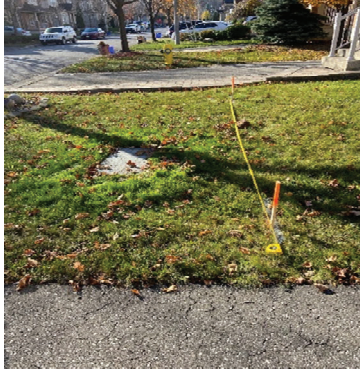
Figure 1: Burgundy Trail

safely, on municipal right-of-way, and in the allowable position. Concerns raised by Mr. Ron Lim have been addressed, including restoration of soft surface in the area and the grade-level box has been adjusted to more level with the surrounding area. Out of abundance of caution, Bell Canada has also offered to conduct a land survey of Mr. Ron Lim's property at Burgundy Trail to show the exact location of the property line. The completed survey confirms all infrastructure was installed in the municipal right-of-way.