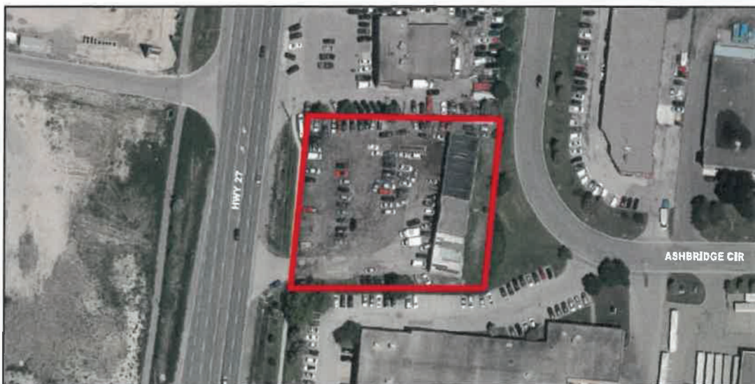
Figure 1: Air Photo of the Subject Land

The subject property is located on the east side of Highway 27, north of Highway 7 in the City of Vaughan (Figure 1).