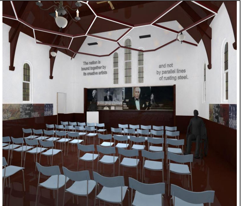
Main Floor in lecture mode