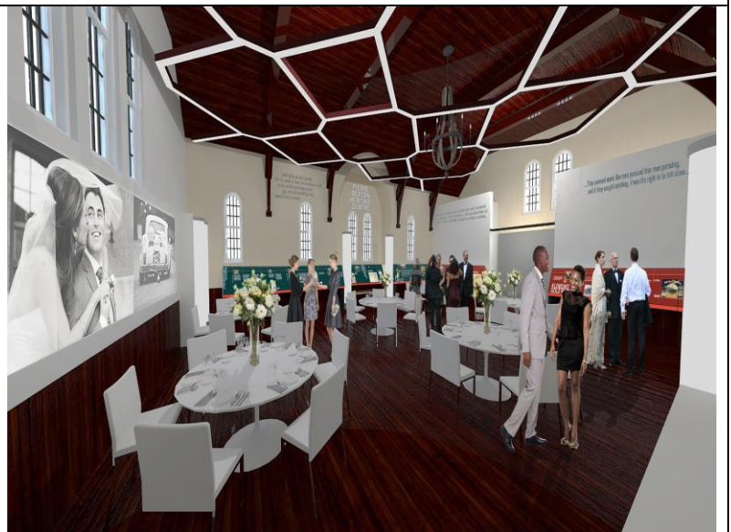
Main Floor in event mode