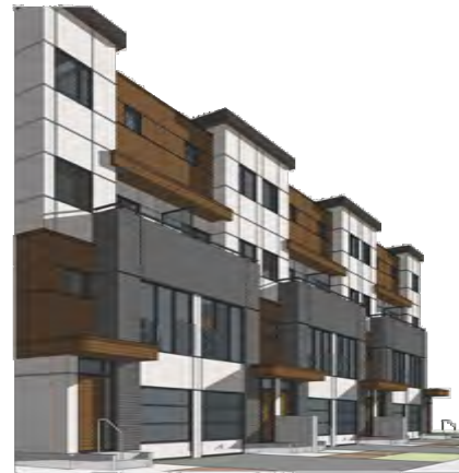
NORTH-EAST ELEVATION - LOOKING WEST