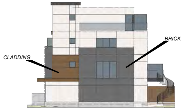
WEST (SIDE) ELEVATION - FACING ISLINGTON AVENUE