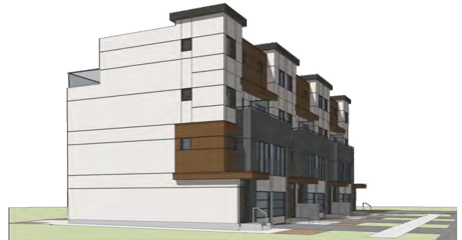
NORTH-EAST (SIDE) ELEVATION