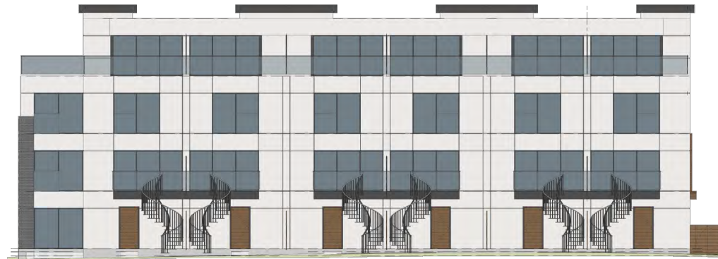
SOUTH (REAR) ELEVATION