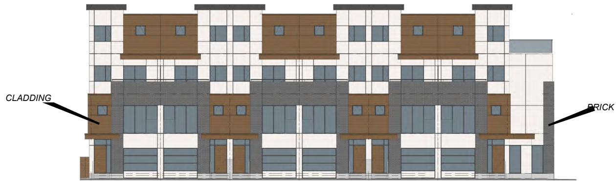
NORTH (FRONT) ELEVATION - FACING HARTMAN AVENUE