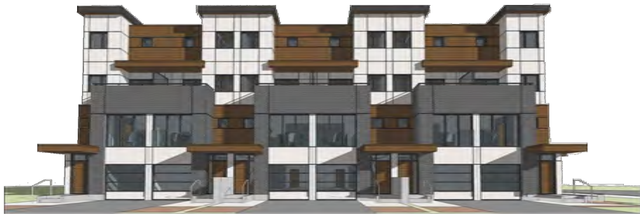
NORTH (FRONT) ELEVATION - FACING HARTMAN AVENUE