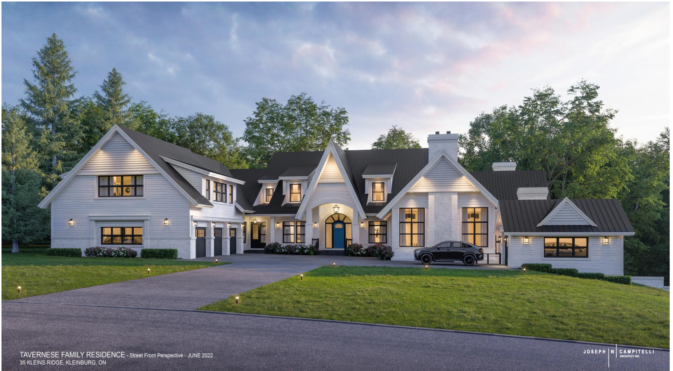
TAVERNESE FAMILY RESIDENCE - Street Front Perspective - JUNE 2022 35 KLEINS RIDGE, KLEINBURG, ON