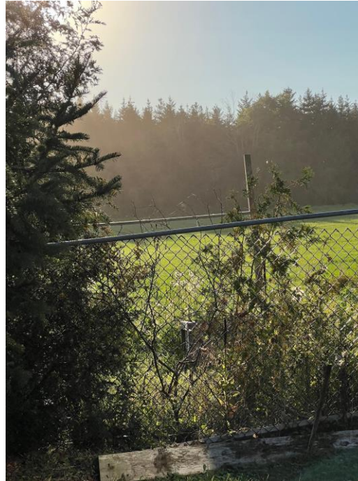
Truck yard dust impacts 11420 Cold Creek Rd.