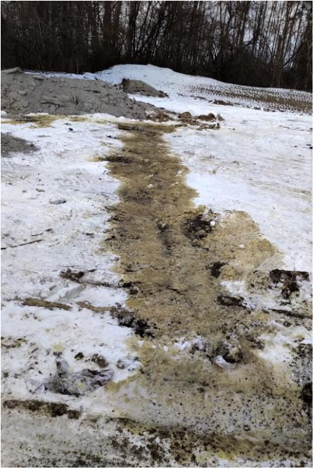
Oil spill 11621 Cold Creek Rd. Illegal Truck Yard