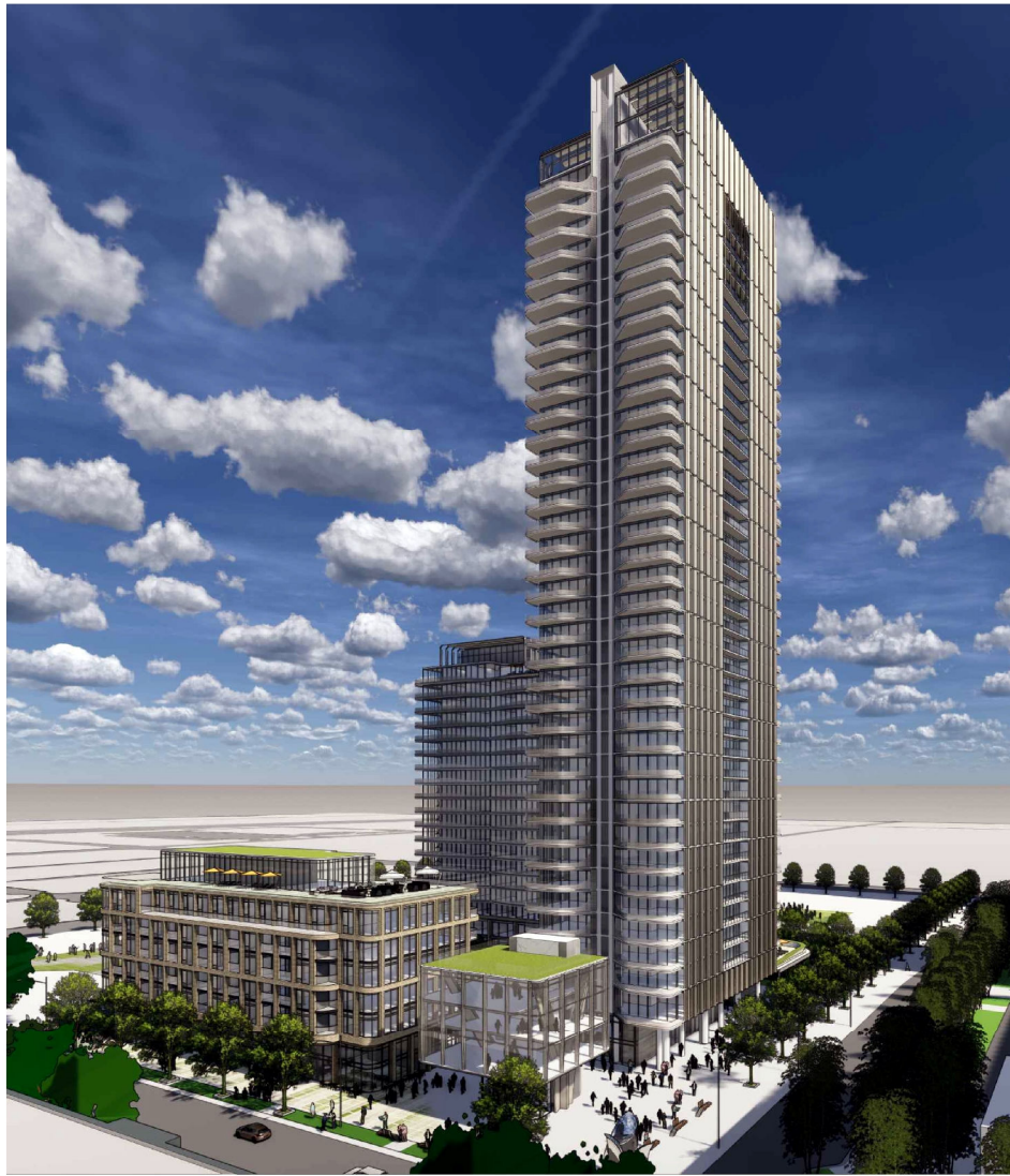
BIRDS EYE VIEW LOOKING NORTH WEST FROM APPLE MILL ROAD AND BUTTERMILL AVENUE