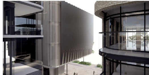
VIEW LOOKING SOUTH FROM COURTYARD