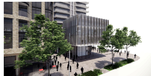
VIEW LOOKING SOUTH FACING APPLE MILL ROAD