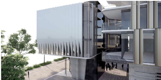
VIEW LOOKING EAST FACING FUTURE BUTTERMILL AVENUE