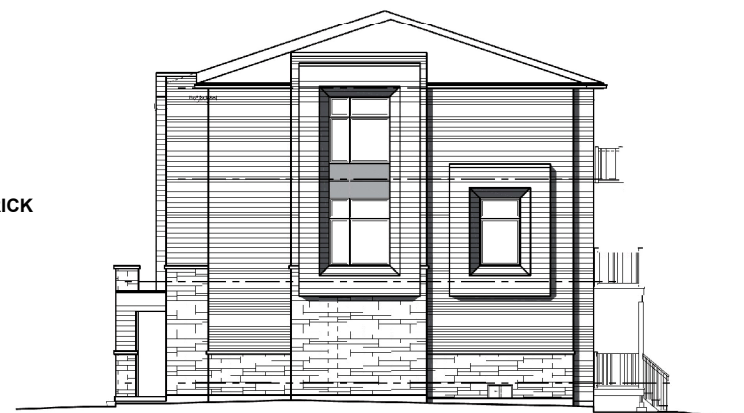
WEST ELEVATIONS - FACING AMENITY AREA