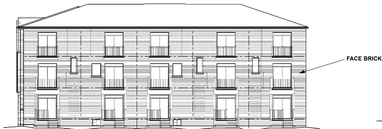
SOUTH (REAR) ELEVATIONS