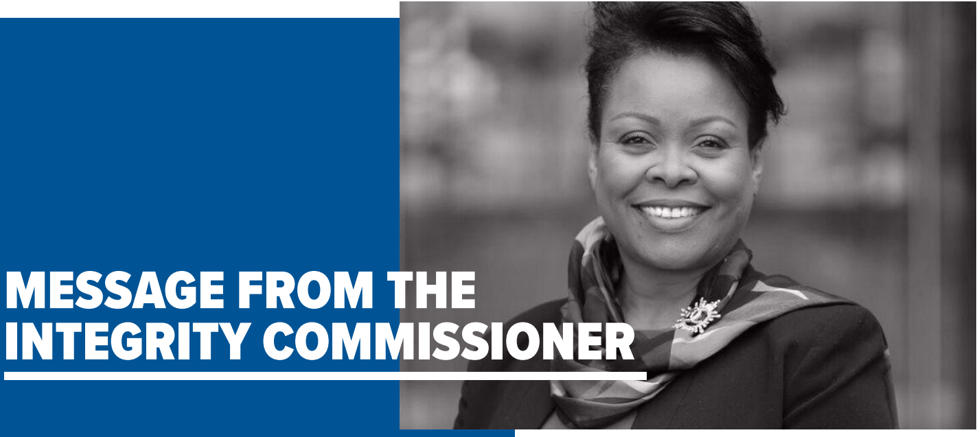
This report covers the 2021 reporting year¹ and sets out the City of Vaughan's Office of the Integrity Commissioner and Lobbyist Registrar activities and decisions over the reporting year. I am pleased to provide this Annual Report

to highlight actions and key accomplishments in 2021.