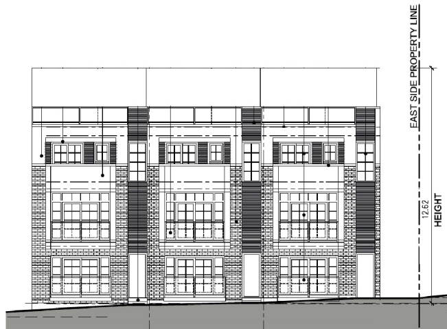
TYPICAL FRONT ELEVATION (BLOCK 4)