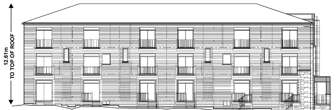
SOUTH (REAR) ELEVATIONS