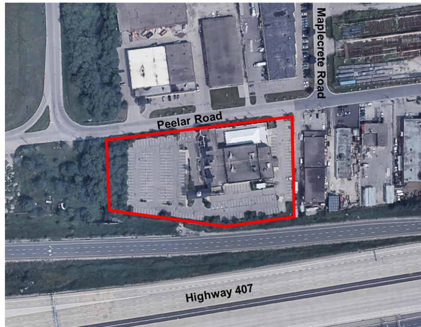
Figure 1 - Air Photograph of Subject Property

Consistent with their location immediately adjacent to Highway 407, the subject lands are situated within an area of the City that consists predominantly of industrial and employment land uses. To the west of the subject lands are existing woodlands, and to the north and east are employment uses.