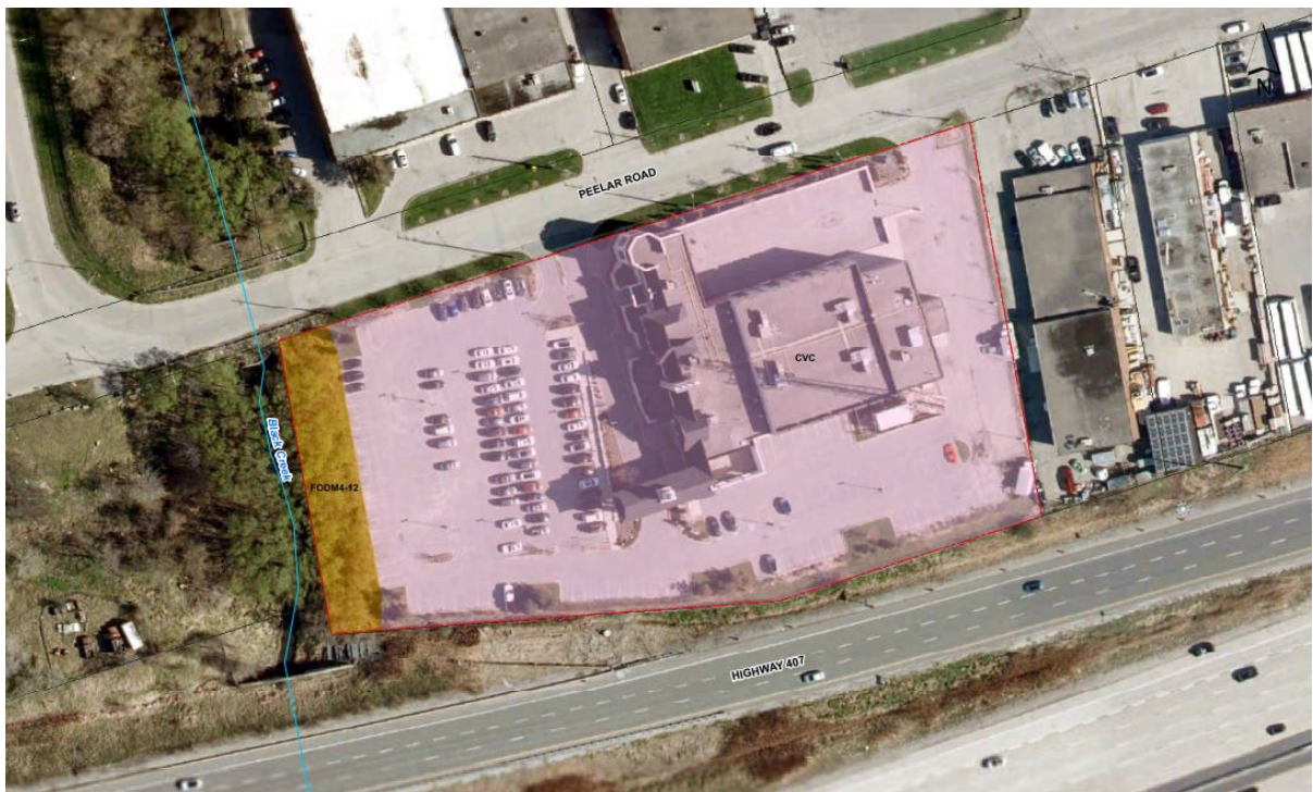
Figure 2: Ecological Land Classification Mapping prepared by Pinchin Ltd.

We recognize that additional study is required in order to fully understand the nature of the Western Strip. We would appreciate an opportunity to provide additional background information to the City of review and consideration of an appropriate land use designation for the lands given these findings.