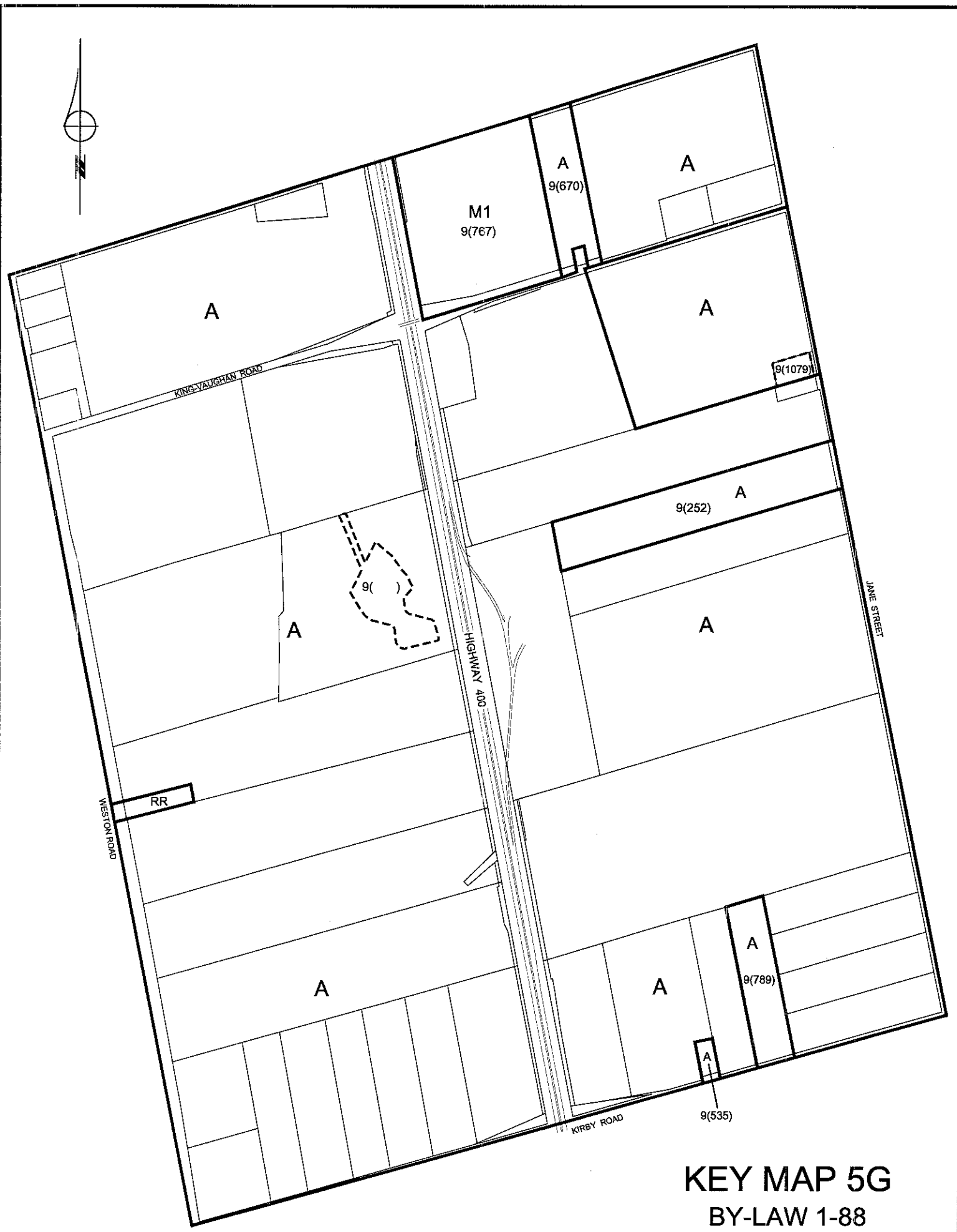
KEY MAP 5G BY-LAW 1-88