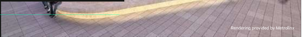
Rendering provided by Metrolinx

Beginning with a single artist, the performances will build along the route, emphasizing spontaneity and joy , and creating community for the engaged audiences. The experiences will culminate each day at Union Station, taking over train platforms and then moving up onto the street.