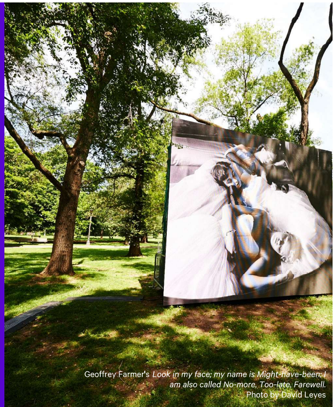
Geoffrey Farmer's Look in my face; my name is Might-have-been; I am also called No-more, Too-late, Farewell.

Reciprocity. Belonging. Invitations to be present with yourself. In relationship with others. At sites designed to inspire connection , reflection and possibility.