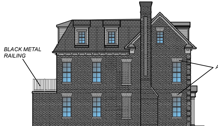
NORTH (REAR) ELEVATION