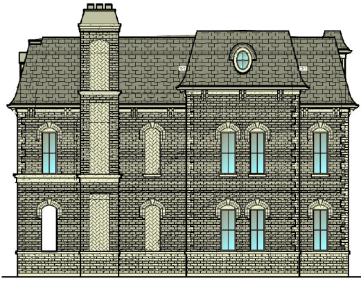
EAST ELEVATION - FACING KEELE STREET