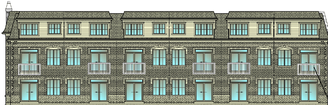
NORTH (REAR) ELEVATION