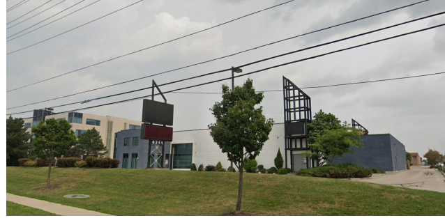
View northeasterly towards 8311 Weston Road (Subject Lands) from Weston Road