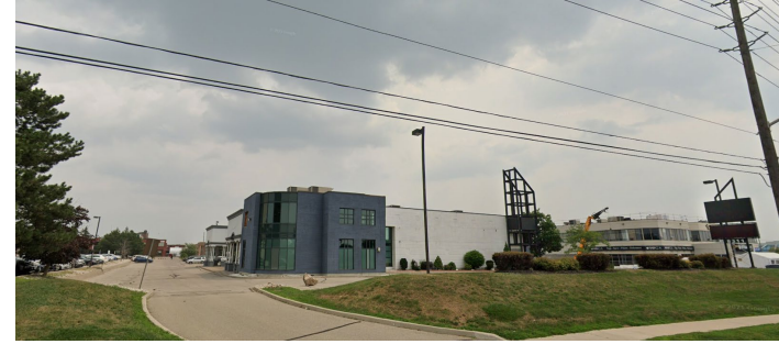
View southeasterly towards 8311 Weston Road (Subject Lands) from Weston Road