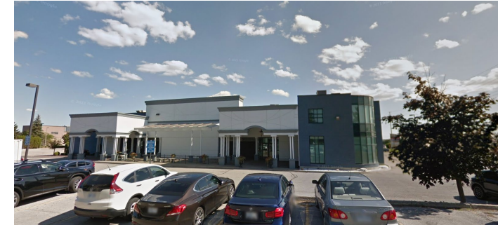
View southerly towards 8311 Weston Road (Subject Lands)