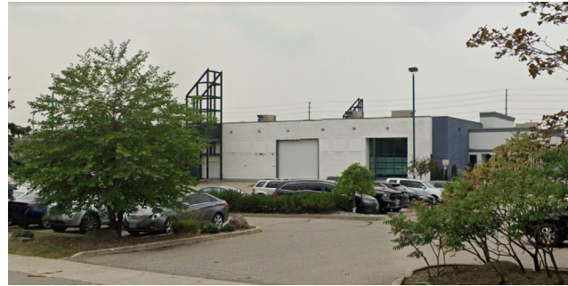
View westerly towards 8311 Weston Road (Subject Lands) from Jevlan Drive